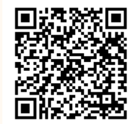
Scan to Verify

verify on www.lawctopuslawschool.com/certificate-verification/139229615-1334BD444-12722E48A